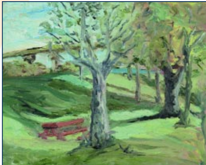
Corning Preserve.

The evening will begin with a half hour of socializing while enjoying C.H. Evans Brewing Company's famous beers and ales or other beverages from the cash bar. A buffet dinner will follow at 6:30 pm. The menu will include a Crudites Platter, the House Salad, Mediterranean Tortellini, Pasta Primavera, Chicken Stir Fry with Peanut Sauce on the side, and Sorbet.