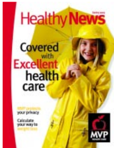
Cover Design by Lauri Baram

character it needs to secure a strong position in the competitive realm of American craft brewing.